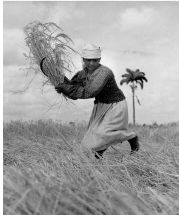
Reaping Rice "Coolie Labour enabled the Europeans to save the decline of their plantations....."

In conclusion, this book is like my saving grace, it taught me a great deal, pointed out auspicious points in my heritage and I love it. It gave me satisfaction and fulfilment when reading it and I would read it again. □