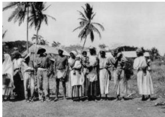
“Coolie” Immigrants—British Guiana

It is also useful as a resource book because